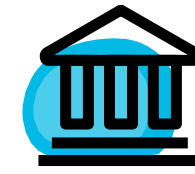
Banking & Finance

Our Business Communities are comprised of international teams of partners, managers and diverse clients that share a common goal: to satisfy clients globally and locally through their obsession with innovative products and quality results.