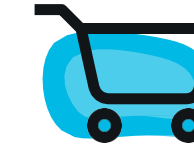
Consumer Products & Retail