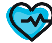
Healthcare & Life science